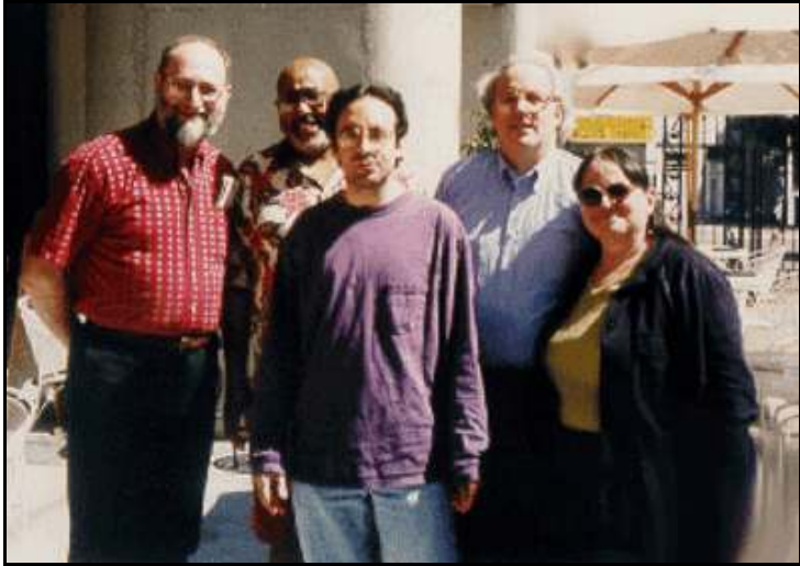
Amateur Computerist Staff in 1998