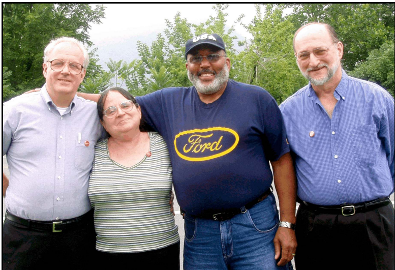
Amateur Computerist Staff in 2003