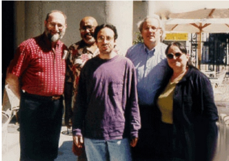
Amateur Computerist Staff in 1998

Permission is given to reprint articles from this issue in a non profit publication provided credit is given, with name of author and source of article cited.