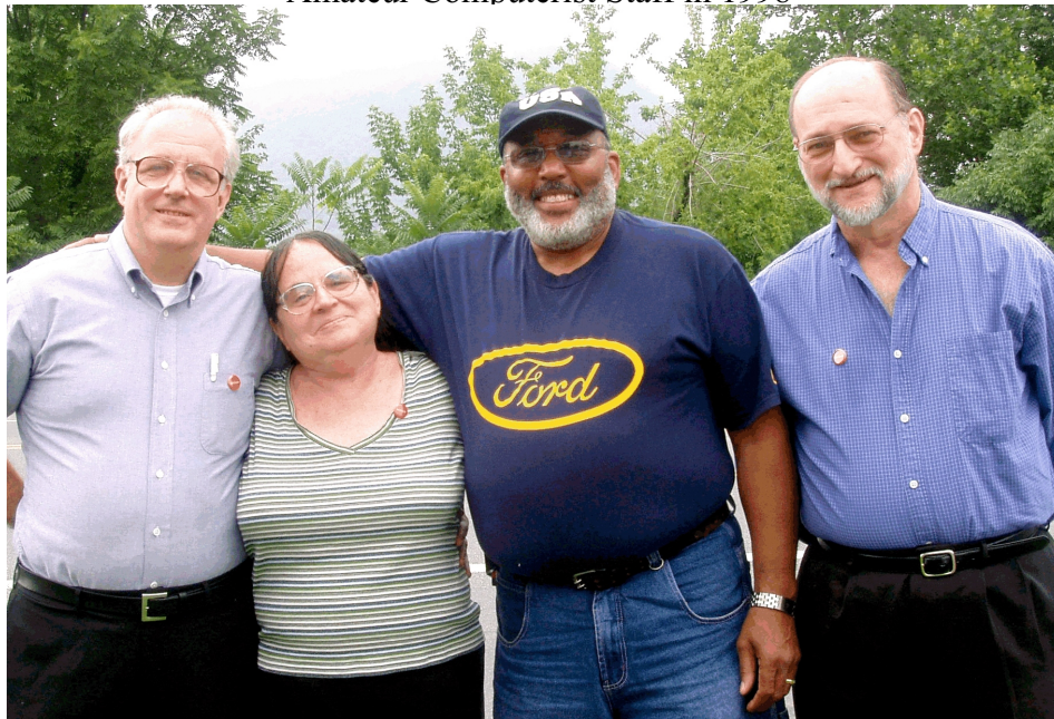
Amateur Computerist Staff in 2003